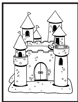
Lesson 10 KC 1

COLLECT the children’s castle papers and tell the kids they will be able to take the paper home later.