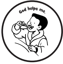
Lesson 10 SG 14