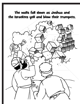
Lesson 10 SG 13