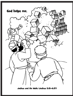
Lesson 10 SG 15