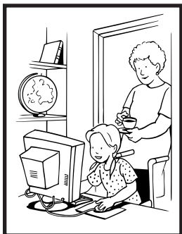
Lesson 10 LG 4