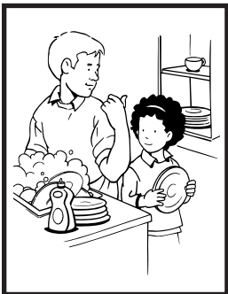
Lesson 10 LG 2

[Pull out picture of Child playing (LG 3).]