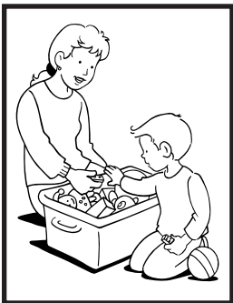
Lesson 10 LG 3